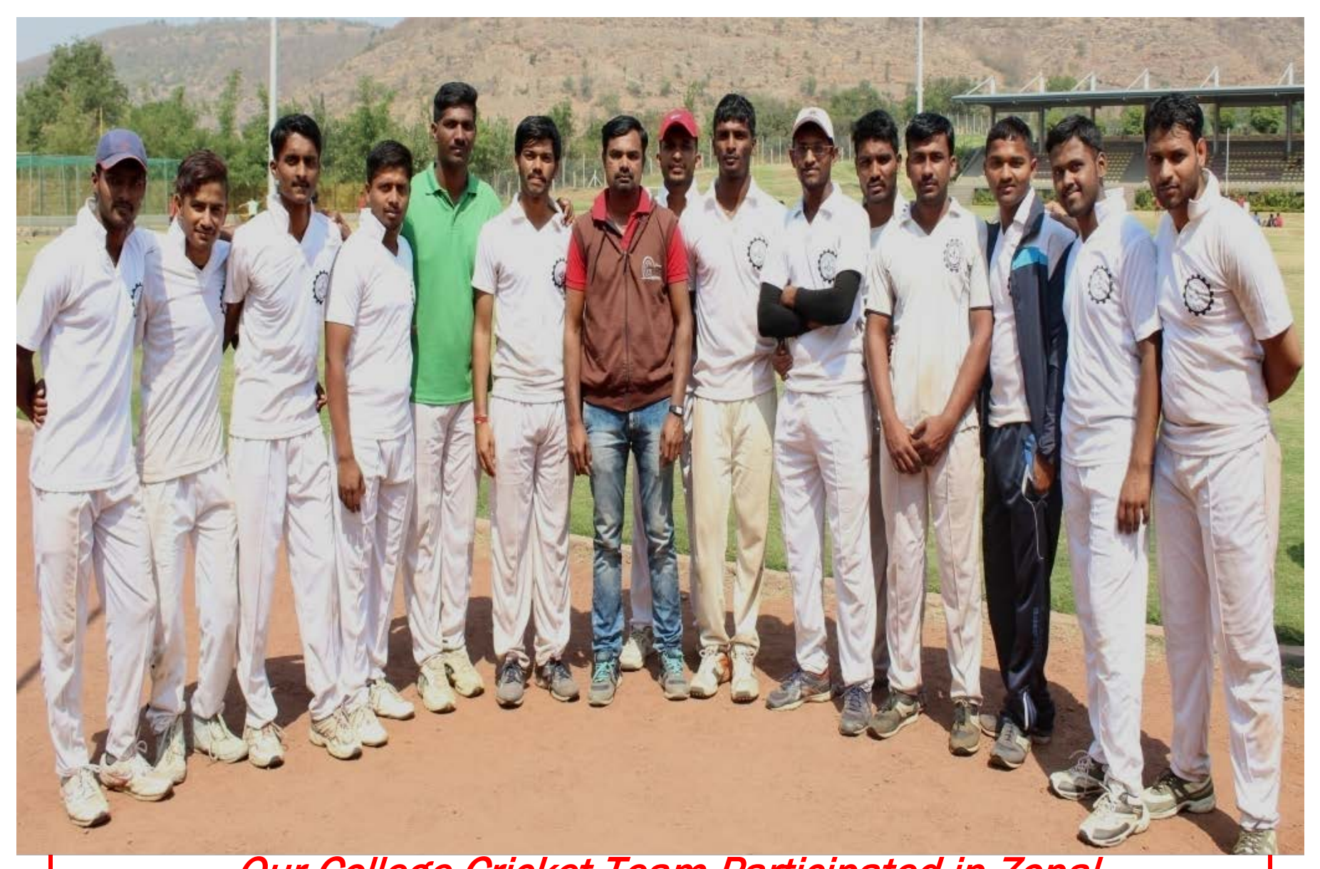
Our College Cricket Team Participated in Zonal Cricket Tou.2017-18 – Sangli.