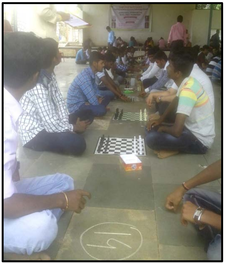
Our College Students in Zonal Chess Comp. - Shirala